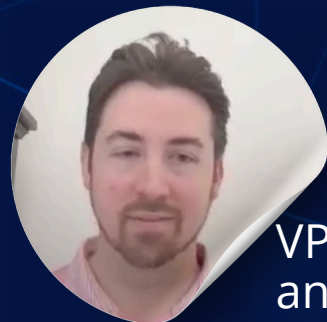
VP of Information Security and Technology Operations

“ At Enlace Health, a large focus has been on maturing and adding capabilities to our security program. We faced significant cybersecurity challenges. Managing third-party vendor risks, preparing for HITRUST audits, and enhancing our overall security maturity were daunting tasks. The Log4j vulnerability incident further highlighted our need for a robust security program. ”